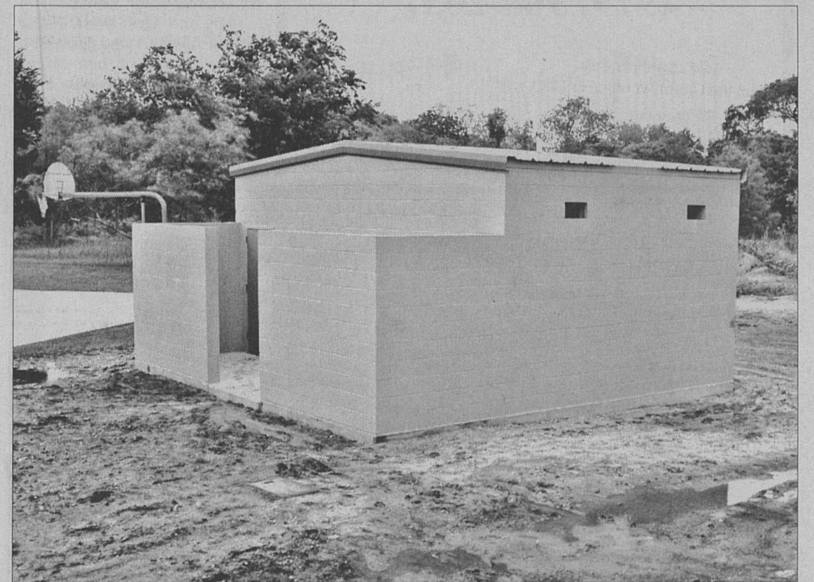
Work is nearing completion on the new restroom facility at E.H. Henry Park.